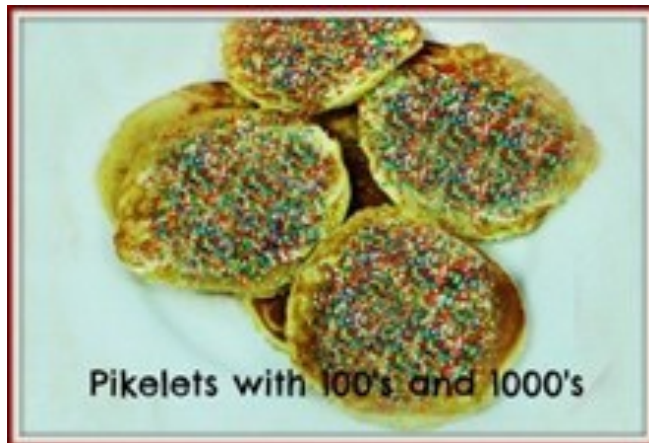
Pikelet with sprinkles $15.00

(Note: Lolly bag will be given out to children at the end of the day to have at home.)