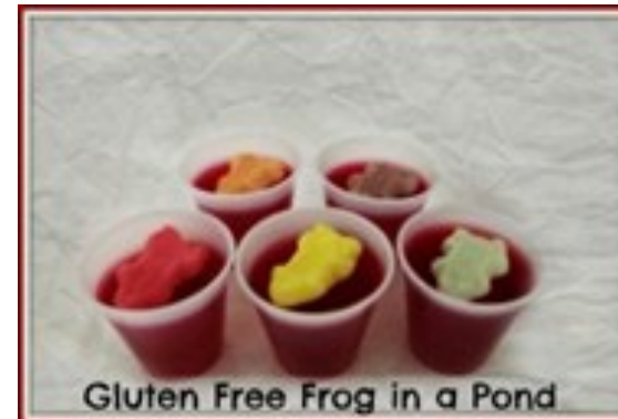
Frog in a pond Jelly Cup (Gluten Free) $22.00

Every birthday child who orders classroom celebration packs through the canteen will receive a special birthday treat. Orders for Birthday Celebrations can be placed in your child's class lunch order bag at morning assembly. Payment is required at time of ordering. A week's notice is required for all Birthday Celebration Packs.