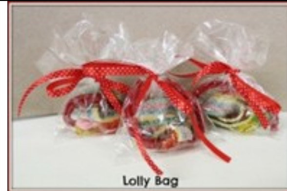
Lolly Bag (Gluten Free Option available) $20.00

(Note: Lolly bag will be given out to children at the end of the day to have at home.)