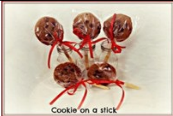
Cookie on a stick $25.00